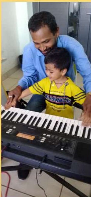
Little ones enjoying a music session with their Music Teacher