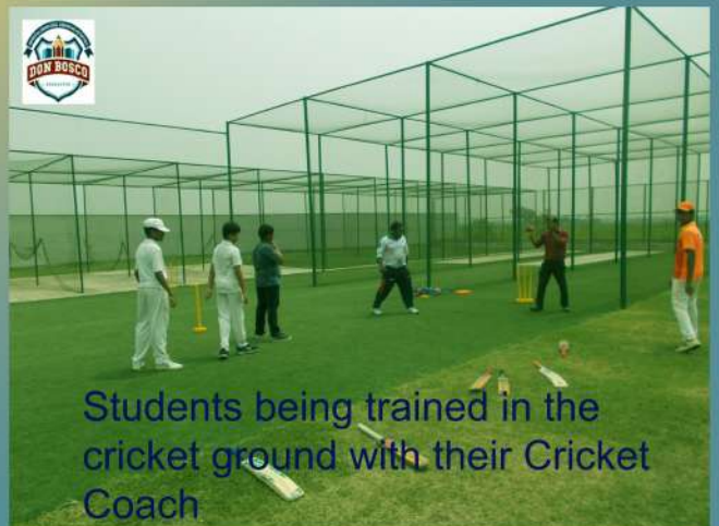
Students being trained in the cricket ground with their Cricket Coach