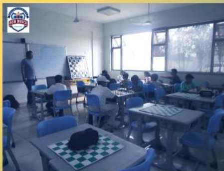
CHESS training during the summer camp